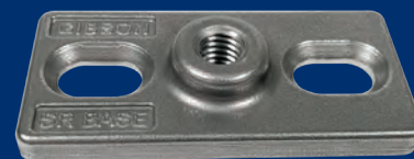
Split Ring Mounting Plate