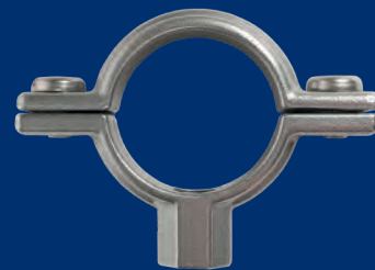
Split Ring Clamp

FOR MORE INFORMATION CALL 1.800.945.4316 OR YOUR LOCAL REP